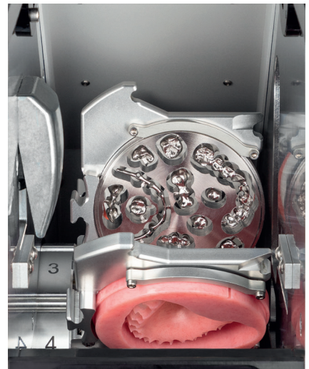
8-fold disc changer