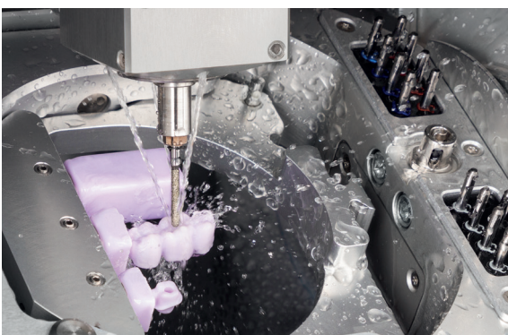
Wet grinding optional